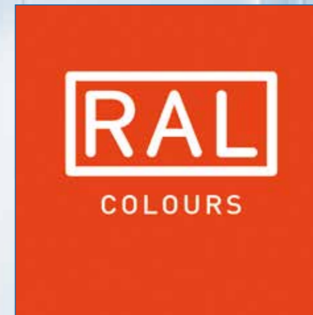
Glass & Aluminium Profiles In RAL Colours Upon Request