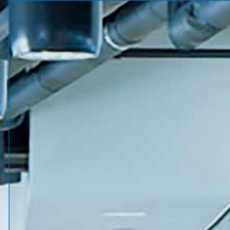
Clear Glass As Standard